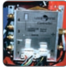
Electronic controller ensures infinitely variable speed control, soft acceleration and low power consumption.