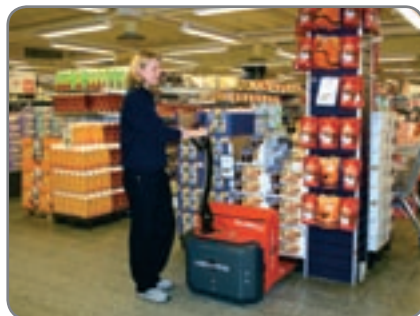
Panther Mini (capacity 1400 kg) is recommended for easy pallet transport, e.g. in super markets and in stock areas.