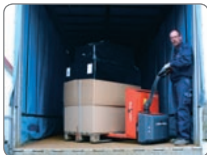
Panther Maxi (capacity 1800 kg) is recommended for heavy pallet transport, e.g. in the transport industry.