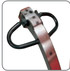
Possible to operate with handle upright. Central location of all control buttons.

Strong construction ensures a long operating life and low maintenance costs.