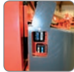
Easy access to all components makes service of the truck straightforward.